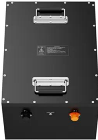
Photo-rechargeable zinc-ion devices merge solar cell ...

Scientists have made a battery that can be directly charged in sunlight without needing an external solar panel. Clever design of the battery electrodes ...