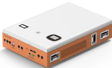
Image Classification of Solar Inverter Models for Asset ...

12.8V6Ah Nominal voltage (V):12.8 Nominal capacity (ah):6 Rated energy (Wh):76.8 Maximum charging voltage (V):14.6 Maximum charging current (a):6 Floating charge voltage (V):13.6-13.8 Maximum continuous discharge current (a):10 Maximum peak discharge current @10 seconds (a):20 Maximum load power (W):100 Discharge cut-off voltage (V):10.8 Charging temperature (°C):0-+50 Discharge temperature (°C): -20-+60 Working humidity: <95% R.H (non condensing) Number of cycles (25 °C, 0.5c, 100%doD): >2000 Cell combination mode: 32700-4s1p Terminal specification: T2 (6.3mm) Protection grade: IP65 Overall dimension (mm):90*70*107mm Reference weight (kg):0.7 Certification: un38.3/mdsd