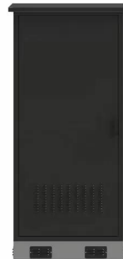
Illustration about 3d rendering energy storage systems or battery container units with solar energy for data center. Illustration of data, battery, energy - 431981604